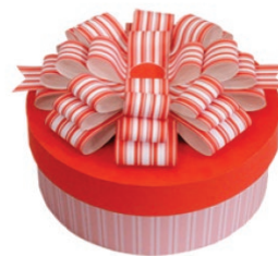
A Box of Kisses

While driving in Pennsylvania, a family caught up to an Amish carriage. The owner of the carriage obviously had a sense of humor, because attached to the back of the carriage was a hand printed sign... "Energy efficient vehicle: Runs on oats and grass. Caution: Do not step in exhaust."